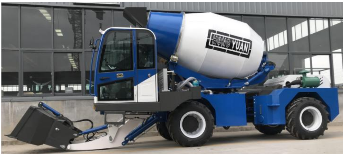
Specification and Photo